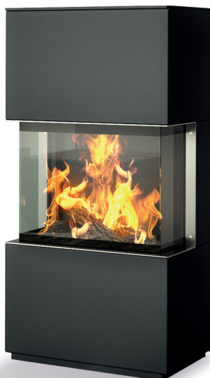
Body black | steel with stainless steel cover